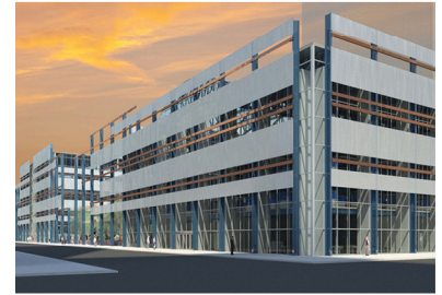
Urban Transit Renewal Perspective along 31st Street

Drexel University, Adjunct Instructor pjmcgranaghan@comcast.net 267.294.9968