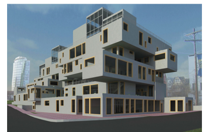
Race Street Live / Work Perspective along Retail Axis