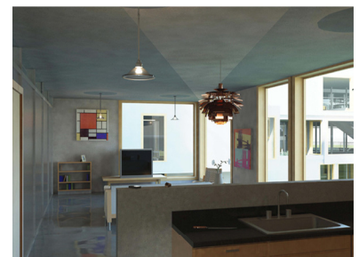
Race Street Live / Work Perspective of Apartment Unit